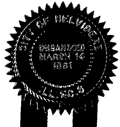
Mike Chamberlain Mayor of Belvidere

IN WITNESS WHEREOF , I have hereunto set my hand and caused the seal of the City of Belvidere to be affixed this 2nd day of April, 2018.