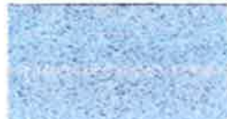
496 CAPE COD GRAY