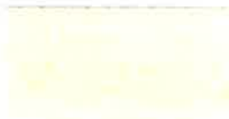
150 OLD IVORY