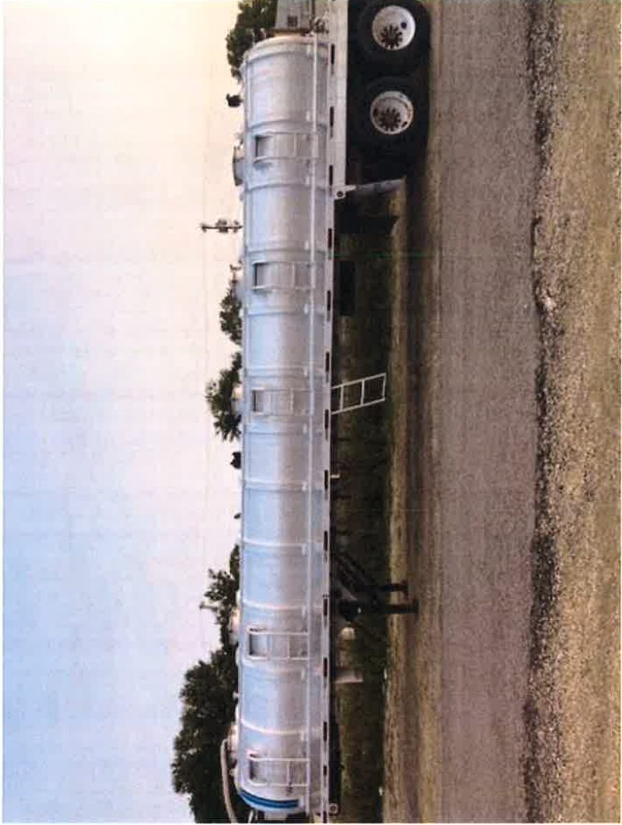
2012 CT Transport 5500 Gallon