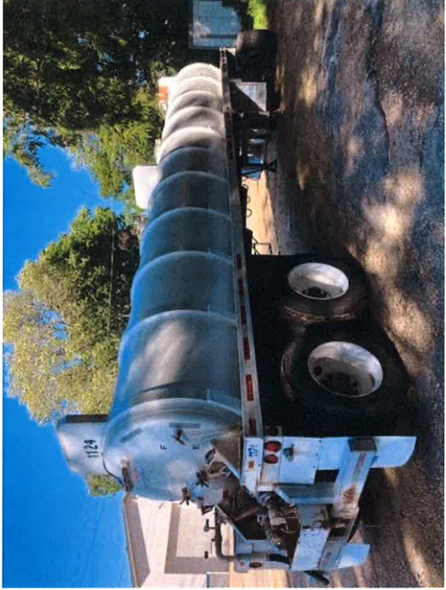
2010 Dragon 6300 Gallon