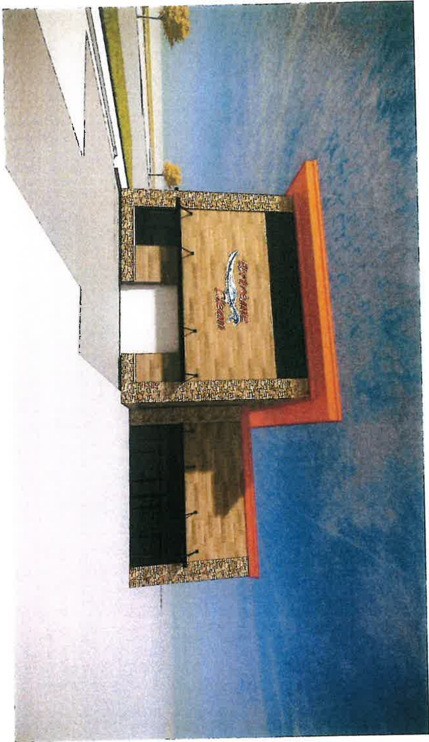
SOUTH ELEVATION-CAR WASH EXIT REVISED SUBMITTAL