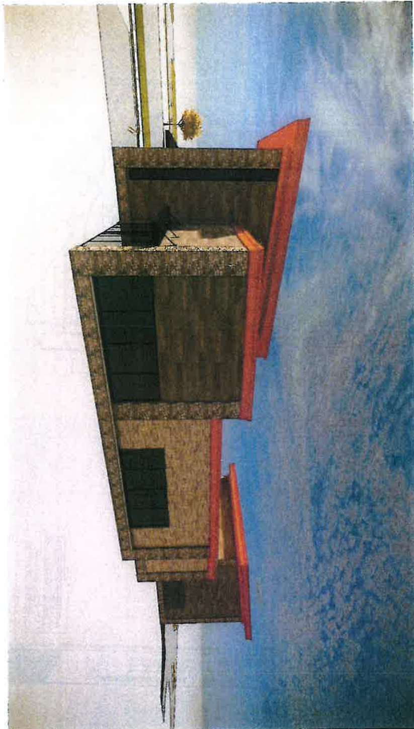
EAST ELEVATION CAR WASH EXIT - RESTAURANT REVISED SUBMITTAL